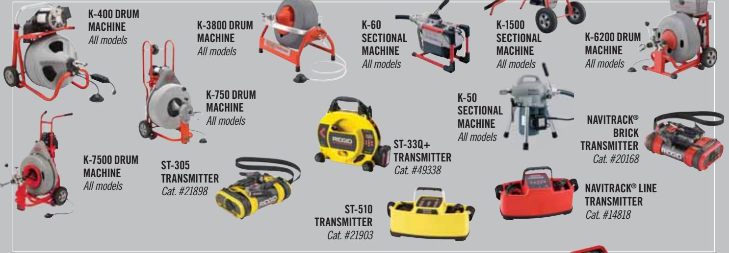
K-400 DRUM MACHINE All models