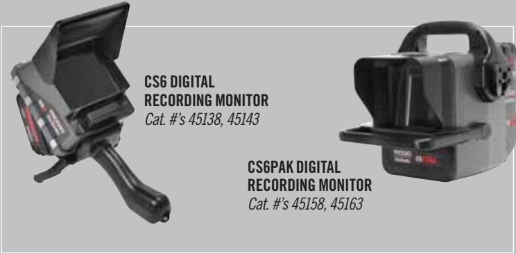
CS6 DIGITAL RECORDING MONITOR Cat. #'s 45138, 45143