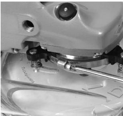
3. Center DustBuddie on the arbor and tighten band clamp.