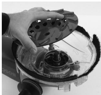
4. Install grinding wheel. (Use the washers provided to adjust wheel slightly below the brushes. You may also adjust the 3 screws if needed)