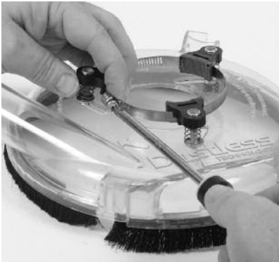
1. Loosen band clamp.