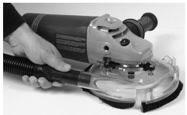
5. Insert hose to port. Secure other end of hose to the electric cord with releasable tie provided.

Go to www.dustlesstechnologies.com for more installation videos and tips