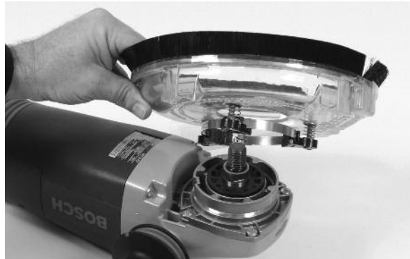
2. Slip around grinder's collar.